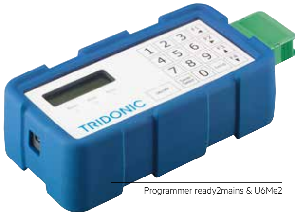
Programmer ready2mains & U6Me2